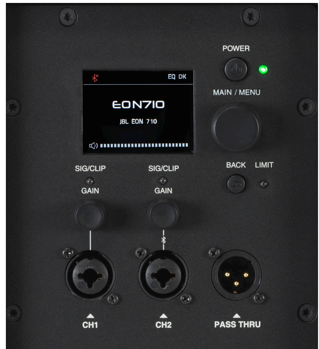
REAR PANEL CONNECTIONS

The JBL EON710 10-inch loudspeaker, part of JBL's new EON700 Series of powered PAs, brings advanced DSP and control to portable systems for live sound and installed applications, with class-leading volume and clarity and comprehensive features that make setup and operation a breeze.